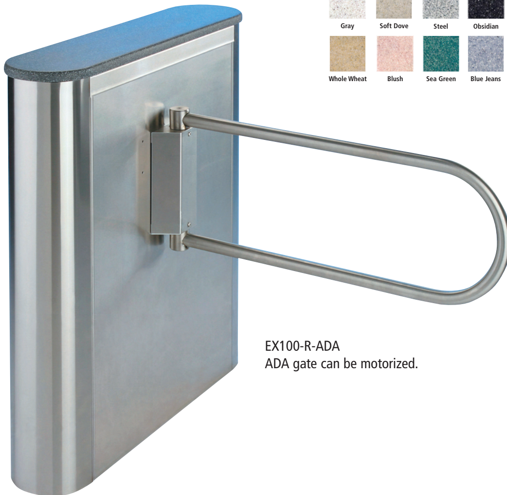
EX100-R-ADA ADA gate can be motorized.